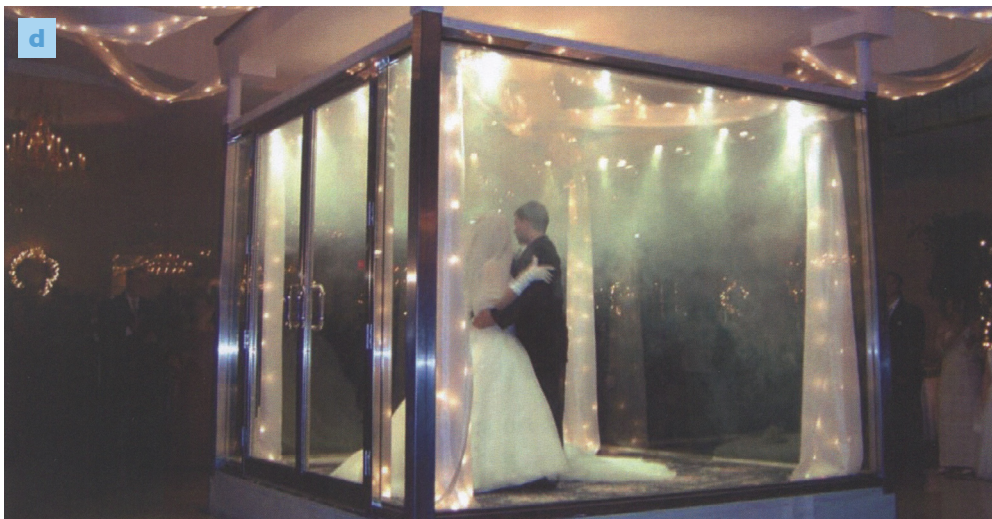
a Happy couple in elevator car on rotating turntable. b Top of the elevator car below surface, flush with the dance floor c Bridal lift during installation. d Happy couple in elevator car on rotating turntable.